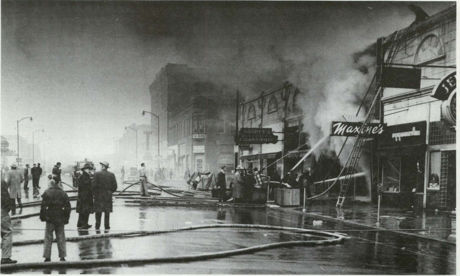
The disastrous Main St. fire of January 1953.