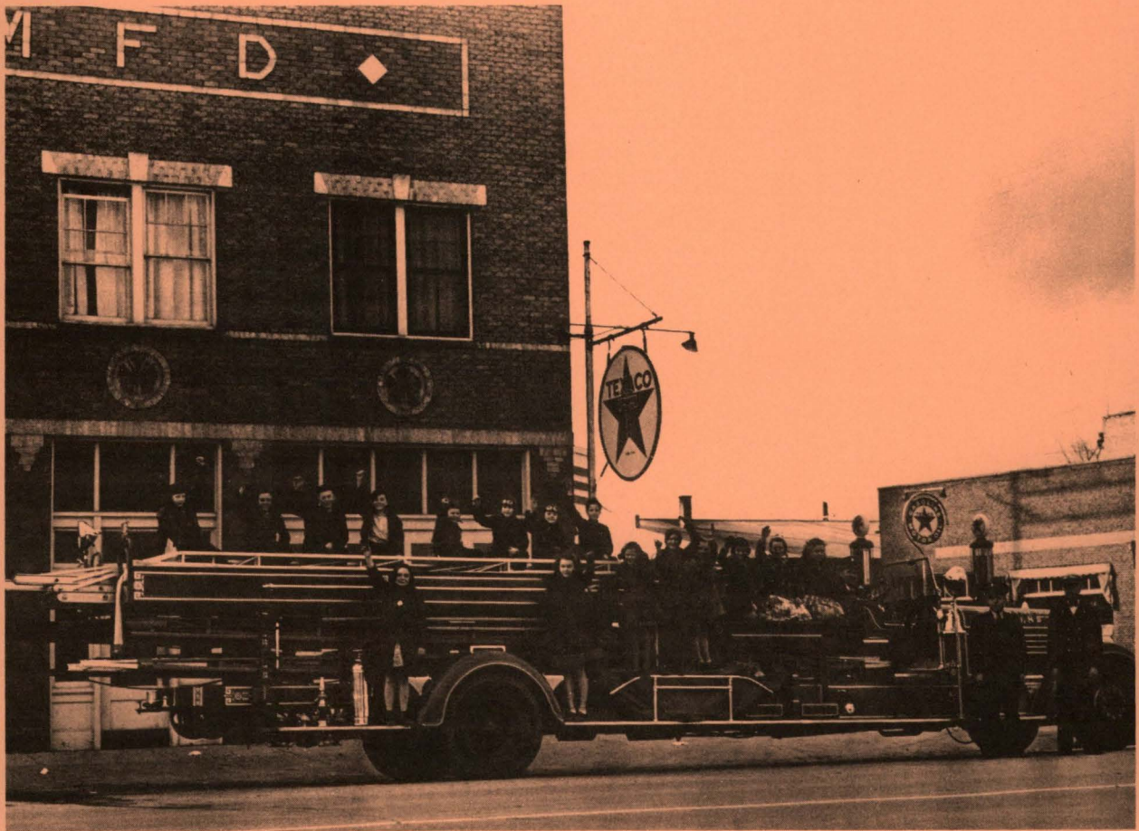
Moscow school children of the 1940's on board the revolutionary Seagrave Aerial Ladder truck of 1936.

The Quarterly Journal of The Latah County Historical Society