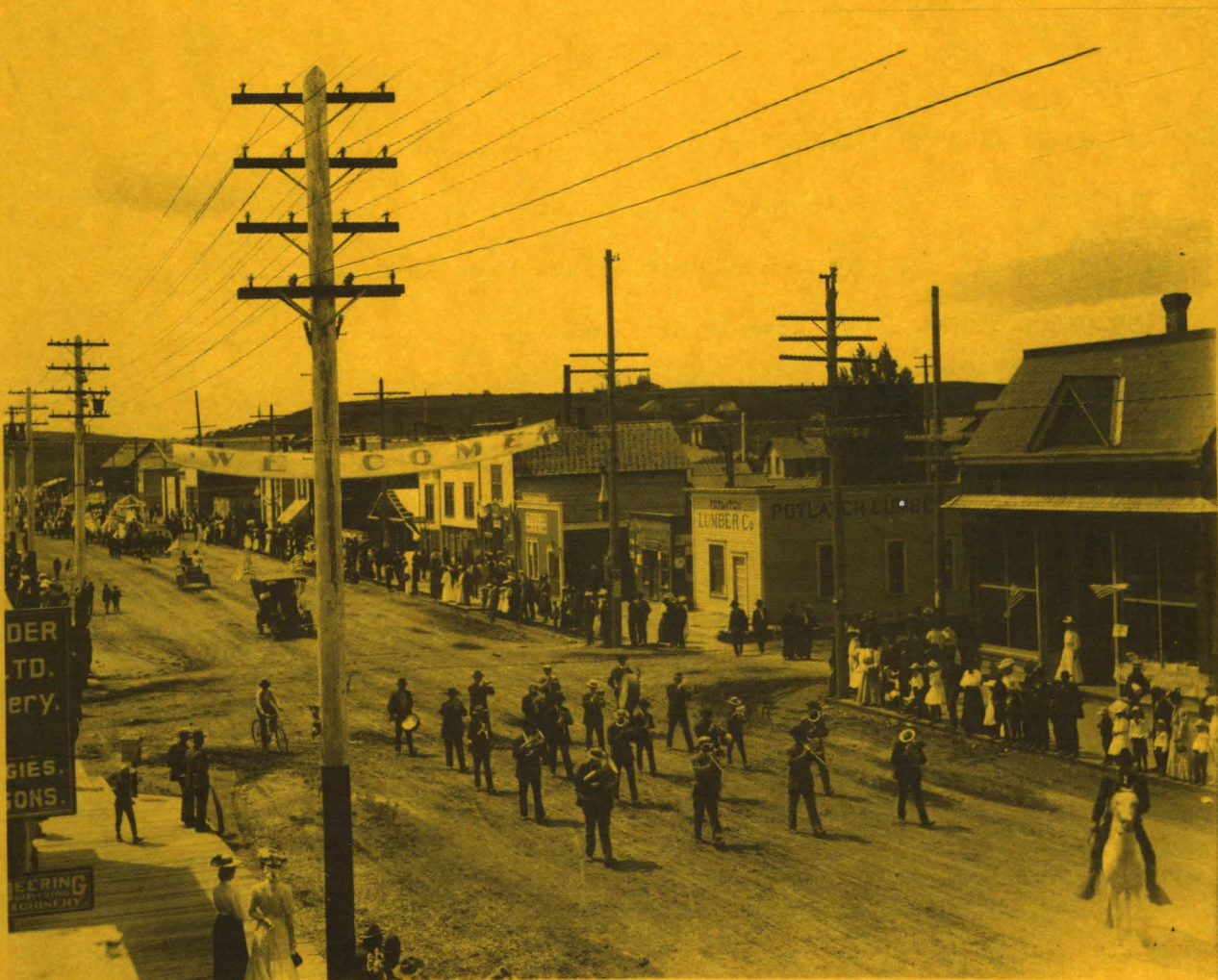
Moscow, Main Street, 1911 Can anyone identify the occasion?

THE DIARY OF HELEN KANE LOST IN THE WOODS THE UNCOVERED WAGON THE MIDGET