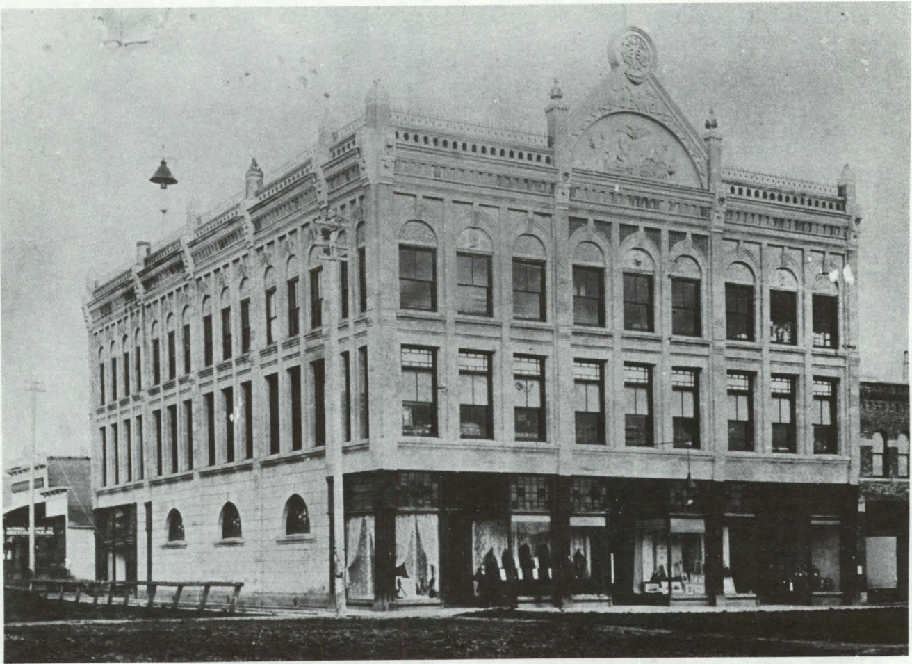
The McConnell-Maguire building in the 1890s; note hitching rack at left.